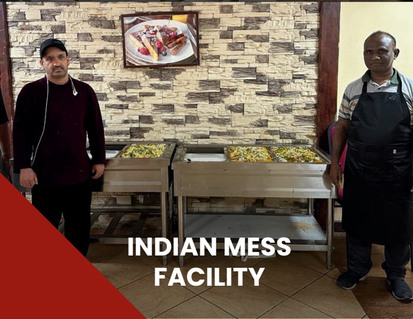
INDIAN MESS FACILITY