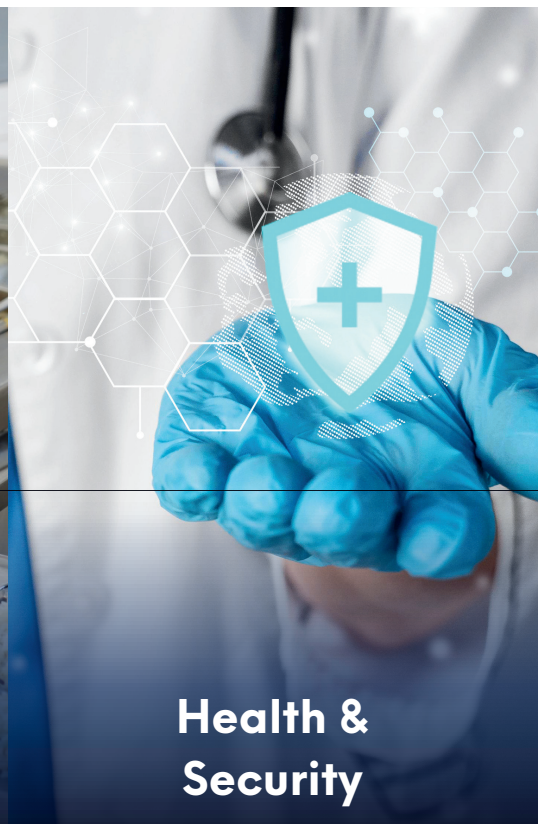
Health & Security