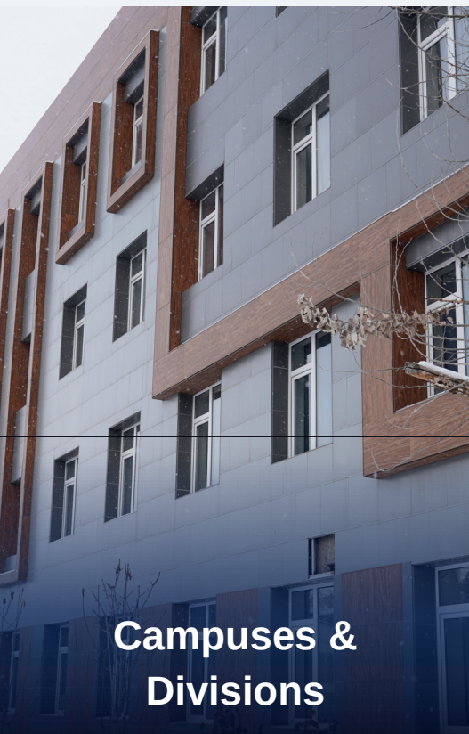
Campuses & Divisions

mountains. The information on academic performance and attendance of students is made available on the school's website each semester to make sure the training process is transparent. IHSM provides accommodation in hostels with modern facilities. Hostels have access to internet services and students are protected by special Security agencies