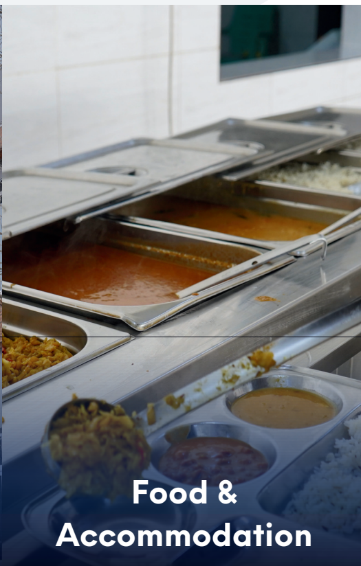
Food & Accommodation